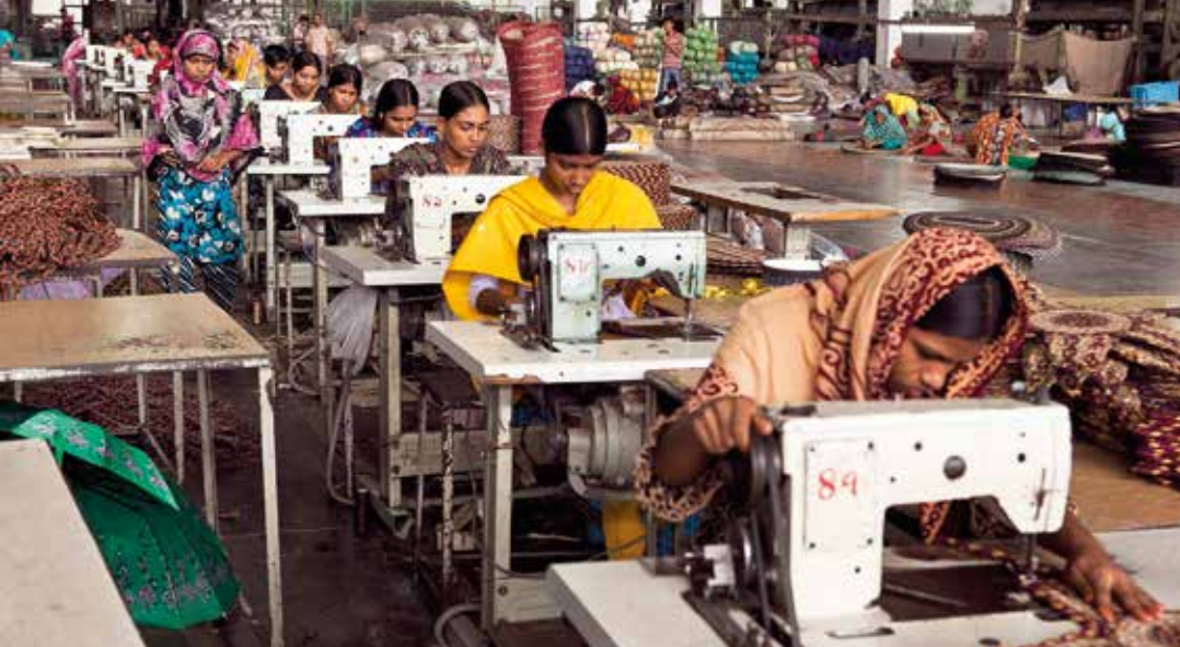
Clothing factory workers, Bangladesh.