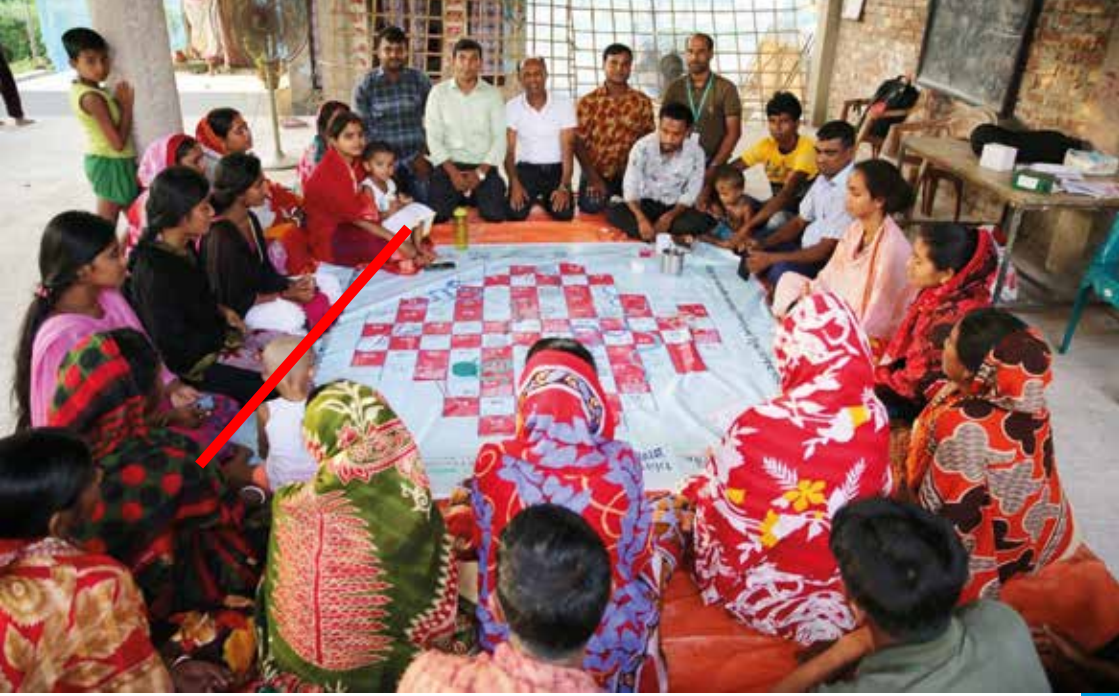
Interactive Ludo Game orientation for community awareness on minority rights and discrimination through a courtyard session in Khulna.