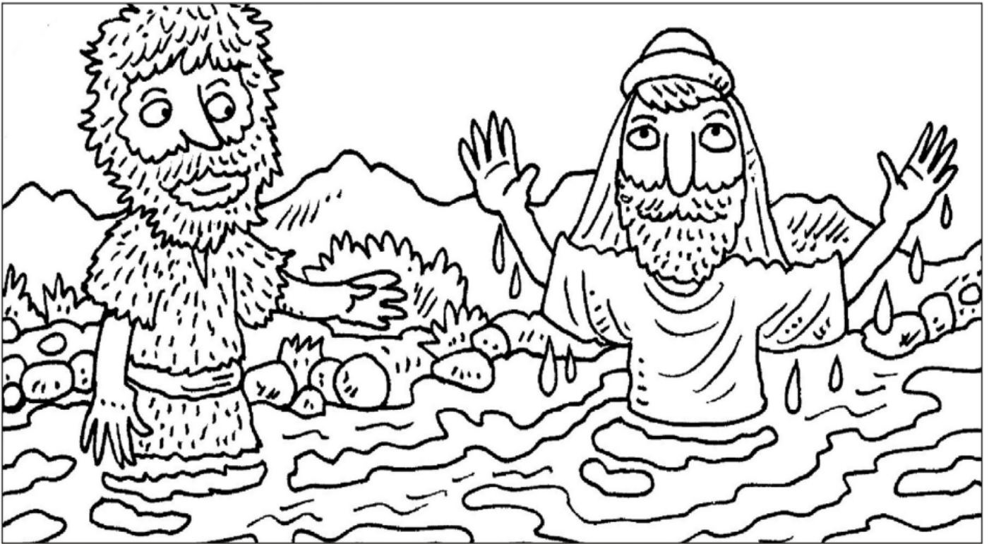
Illustration by lambsongs.co.nz via freebibleimages.org