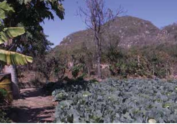
No dig farming in Zimbabwe