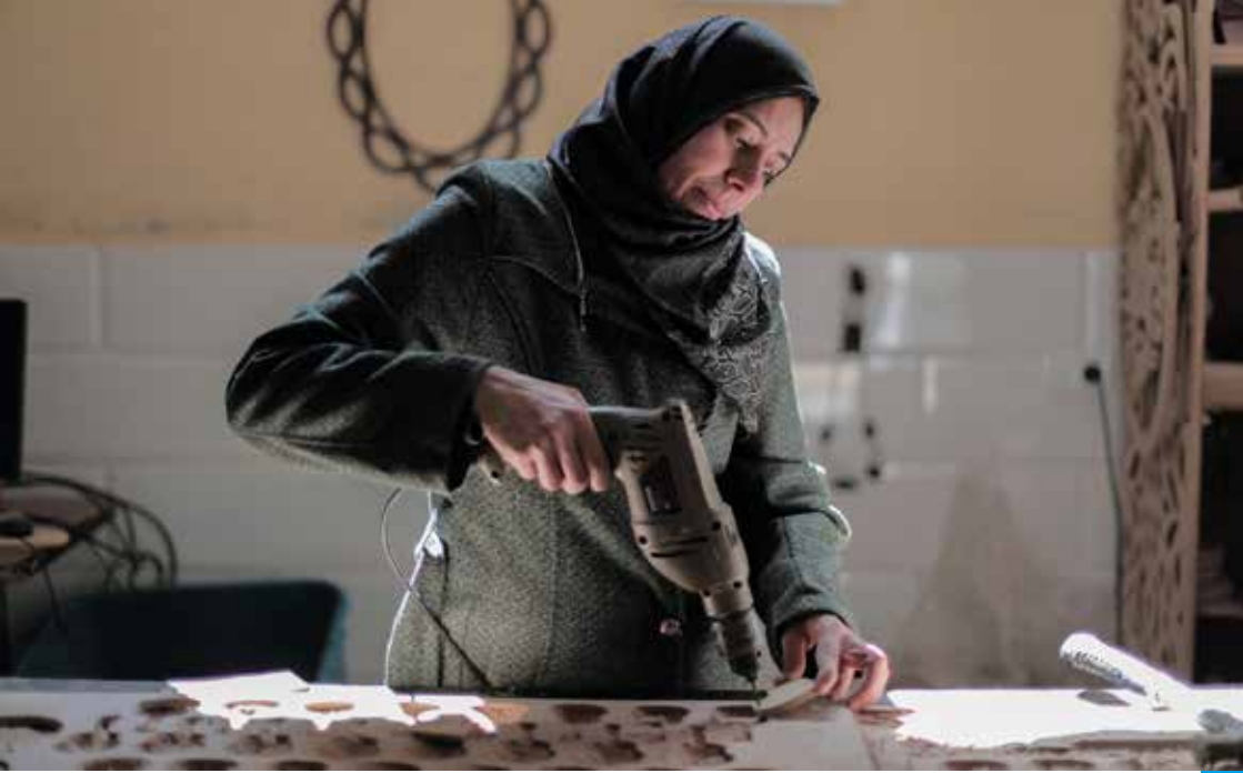
Woman working in Hijab, Palestine