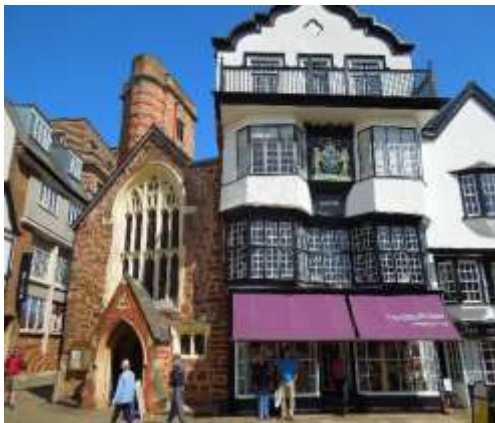
Cathedral Square, Exeter

South and East Devon has 21 URC churches at present with four of them being united and linked with the Methodist denomination and one with the Anglican Church.