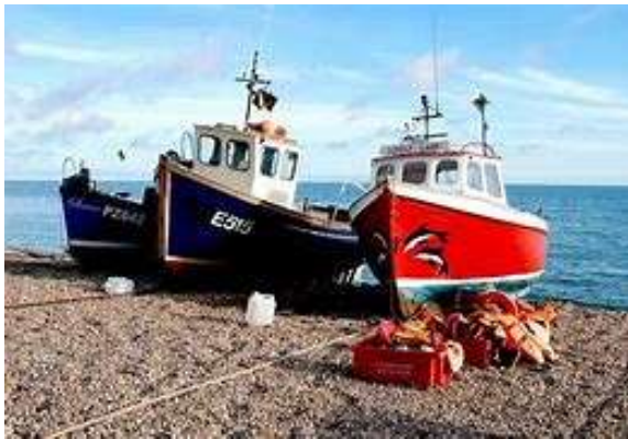
Fishing boats, Beer

The region and the churches attract a significant number of retired people. There is a racial mix in the South West, not always reflected in our churches.