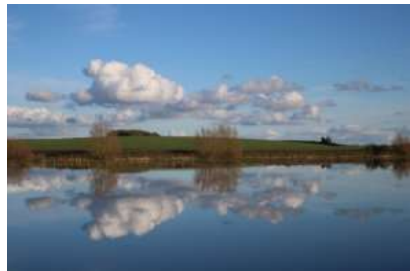
Somerset levels 1

have plans for developing the buildings they now occupy to support local mission. In Bridgwater the three-church pastorate run a community café, are involved in Street Pastors and have a CRCW working with them and as a chaplain at the Hinkley Point power plant construction site. In the Mid Somerset Group the 4 churches, between them, run a food hub in Glastonbury, a community café, have on-going live streaming of services and are working on Eco Church issues. Taunton URC, is hosting a Ukrainian family, offering a warm hub, have a mission to a local nursing home and have recently invited local people of the