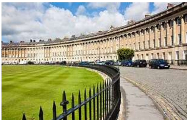
Royal Crescent, Bath

The Synod is large, stretching from Cornwall through Devon and Somerset to Swindon in Wiltshire, and including the Greater Bristol conurbation. This area is home to 4.2 million residents, some 7.5% of the England population. It is one of England's fastest growing regions with the population increasing by 8% between 2011 and 2021. House building is on the rise and people moving out of cities for more rural areas, due to the Covid experience, has had an impact. Another factor being that an increasing number of people retire to the South West from all over the UK.