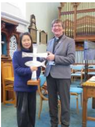
Welcoming a representative of the Bristol Korean church

The March 2023 Synod welcomed a representative of the Bristol Korean Church who, after many years of cross-cultural working with their local URC, are applying to become a local URC.