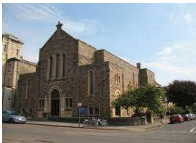
Redland Park URC

Historically Bristol had a huge maritime focus, with its large floating harbour and the historic SS Great Britain as a reminder of these previous glories. Bristol had an active role in the Trans-Atlantic slave trade and this has left a legacy of some great wealth, but also of deep divisions and scars, illustrated by the controversy around the toppling of the Edward Colston statue. The city is sometimes described as having a 'rich' north, with a much 'poorer' south.