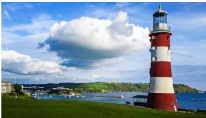
Plymouth Hoe 1

who come just once, while others have holiday homes and may be more involved. Employment especially for young people is mostly in the hospitality industry so there is very little in the winter months. There is a lot of economic deprivation with its attendant problems. It is also hard for people to get on the housing ladder as prices are high due to second homes and landlords only letting to tourists. The upside of this is that there is plenty of potential for churches to get involved in the community.