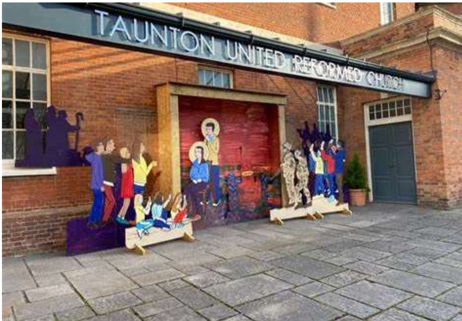
Taunton URC where the Synod Office is located