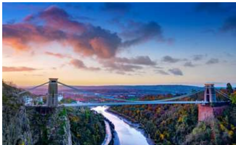
Clifton Suspension Bridge

The South Western Synod's largest conurbation is Bristol, a city and area of approximately half a million people. Although a large city, it is a place that many see as beautiful: built on the river Avon and surrounded by the Mendip Hills, the Cotswold's and the Somerset Levels.