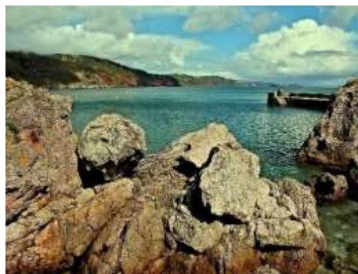
Babbacombe, South Devon

In Exeter, with a recently inducted Minister, the churches are connecting with other denominations, and the cathedral and working with university students. Our Kingsteignton and Dawlish URCs have recently formed a joint pastorate and called a new minister from the United Church of Christ in America. She will arrive in June and work with the pastorate and half time for the Synod. Several of our churches in this area are considering the long-term viability of their buildings and thinking of ways to better connect with and serve their local communities.