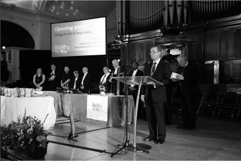
Opening Act of Worship and signing of the Bible (below)