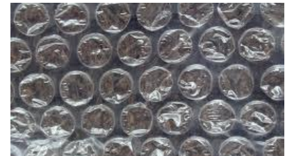
Bubble wrap to make a fire sound