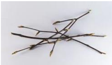
A bundle of twigs to make a tree or bush