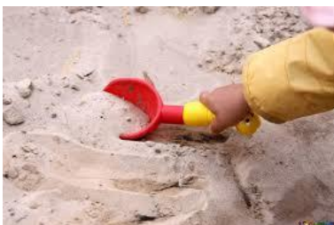
A tray with sand or sand like substance, such as couscous or rice crispies