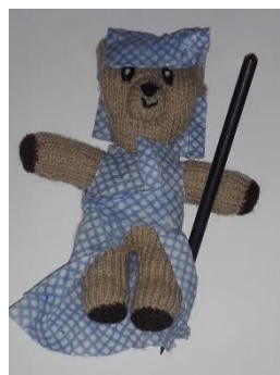
A toy dressed as Moses

Fire coloured paper, fabric or tissue paper – could be cut into a flame shape