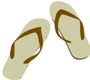
A pair of sandals or shoes