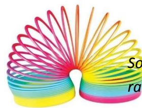
Something with rainbow colours

Fire coloured paper, fabric or tissue paper – could be cut into a flame shape