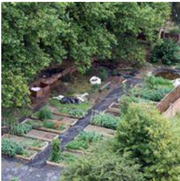
Garden in August 2011 – from church tower

The birds-eye view from the BT platform provided the opportunity to compare the garden now and in 2011, before the mature trees in the garden were pollarded.