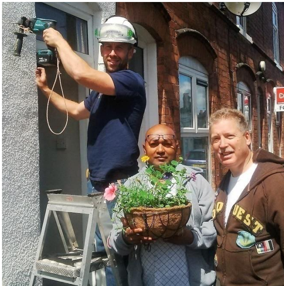
Putting up hanging baskets on Eva Road