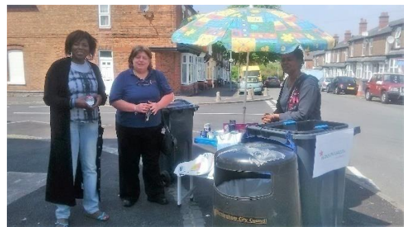
Out and about for Good Neighbour Week

At the beginning of June, we held our Annual Good Neighbour Week as part of preparations for the launch of In Bloom and were able to have further conversations about the work of In Bloom and recruit residents to join the Action Group. It has become clear from that week's activity, that the work of Winson Green in Bloom can easily become a year-round project creating opportunities for the residents to get