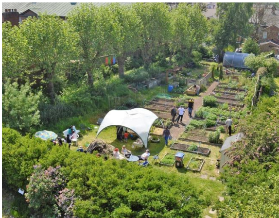
Garden in June 2016 – from BT elevation platform