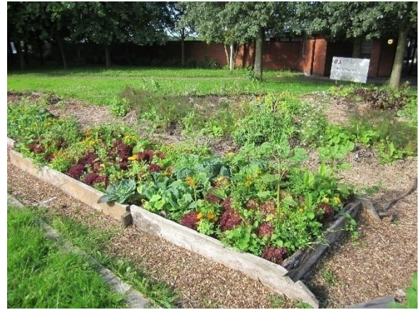
Permaculture Garden at Prison Visitor's Centre