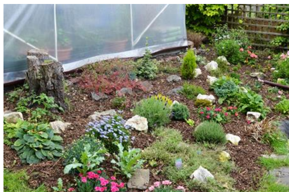
The Rockery – Gary's creation

As well as tending their own raised beds the community gardeners also help to maintain the garden as a whole. Some gardeners have taken on particular responsibilities. For example, Gary has been developing the rockery in front of the polytunnel and has also planted pots and hanging baskets around the garden.