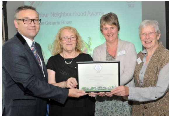
It's Your Neighbourhood Awards 2015

Copies of the RHS and Heart of England In Bloom certificate with the "It's Your Neighbourhood Award of Level 4 – Thriving" were presented to the many people who made the achievement possible.