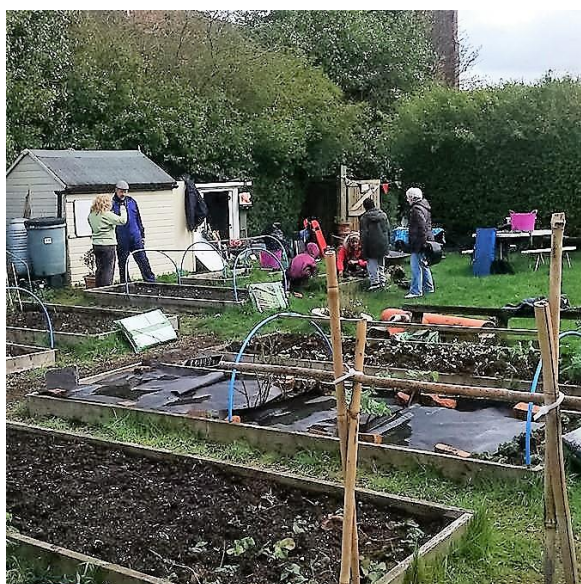
Big Dig Day 2016

We held a Big Dig Day on Sunday 16 th April. This was an opportunity for the community gardeners to prepare their raised beds for the new growing season. A team from BT Openreach joined us on the Friday to put up the fence panels that were blown down the previous month by Storm Katie! The team also added extra height to one of the raised beds to make it more accessible for one of the community gardeners.