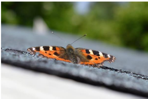
Small Tortoiseshell Butterfly

We take part in the national Big Butterfly Count which this year is from 15 th July to 7 th August. Last year's count included 7 species: Small Tortoiseshell, Small White, Large Skipper, Gatekeeper, Ringlet, Comma, and Speckled Wood. Other species noted this year include Orange Tip, Common Blue, Brimstone, Peacock and Red Admiral.