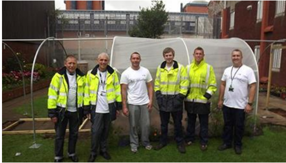
Extending the polytunnel at Birmingham Prison