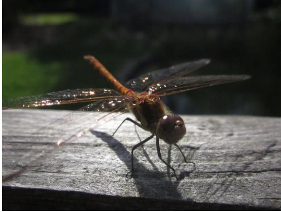
Common Darter Dragonfly

Dragonflies continue to be attracted to the pond – especially in late July and August – but we have yet to find any dragonfly larvae. Species seen include: Common Darter, Broad Bodied Darter and Southern Hawker. Birds too are attracted to the pond; a pair of Mallard ducks regularly visit and Grey Wagtails have also been seen.