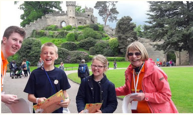
The Big Day Out 2017, Warwick Castle

The URC may be a relatively small Church, but its achievements - both locally and nationally - are substantial. We are 'punching above our weight' in many areas, not least in our commitment to social justice, illustrated through the work of the Joint Public Issues Team (JPIT) in areas as diverse as foodbanks, housing and refugees; the continuing innovation of the church related community work (CRCW) programme; large scale events like The Big Day Out and the URC's associate partnership in the Greenbelt festival as well as initiatives like the celebration of Constance Coltman's centenary and Walking the Way<sup>1</sup>. Alongside all these high profile success stories is the support of local churches, not least through funding the stipends of ministers and ensuring they are assured of reliable pensions and adequate housing in retirement. And, in addition to these things, we also invest in the long-term future of individuals – from training our ordained ministers and lay preachers to giving advice to new church treasurers.